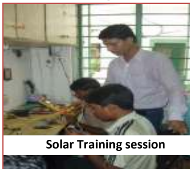
Solar Training session

Activities: Community teachers are regularly taking classes in four centres in Gosaba block and children are regularly attending their classes.