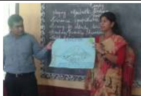
Group presentation - Ideal World

Human Rights: The following trainings were conducted in KMWSC office. Between 14 th till 9 th September (in 13 batches) 432 teachers from 257 Government upper primary schools of Kolkata participated in a two days Human Rights training programme. The training included human rights, child rights, application of the HR teacher’s manual in the classroom and NCPCR guidelines on eliminating corporal punishment in