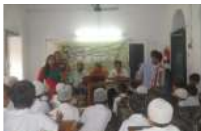
Orientation (Open House Programme)

CHILDLINE: On 3 rd July'2014 an Open House Programme was conducted at Muslim Presidency High School for 42 children from Class – I to V and 6 teachers were sensitized on Childline services and child rights. We also conducted a school sensitization programme at Adarsh Hindi School which was attended by 58 children from classes I to IV. Children performed small skits, songs and issue based drama on child marriage to express their understanding.