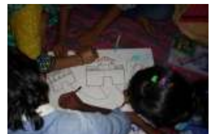
Group work in the training

Barefoot Teachers Training: The following barefoot teacher's trainings were held in the KMWSC office. 99 participants were reached out in four trainings during this session.