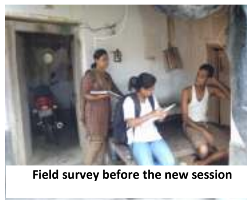
Field survey before the new session

Brick field school project (BFS): The new session will start from 3 rd November 2014 as by the end of October the families start to migrate and settle in these Brickfields for work. The BFS staff did a lot of ground work before the session by way of selection of new NGOs, teachers, Training of the new teachers, preparing the curriculum /syllabus, NGOs orientation and related administrative works.