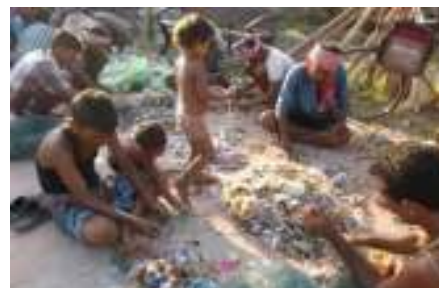
Sorting and collecting fishes

Fisher Folk: After the successful implementation of “Fisher Folk Project “in Odisha, a similar programme in the coastal area of Kanthi (also known as Contai) in the district of Purba (East) Medinipur was started from 22 nd July 2014–, as a pilot phase in collaboration with Kajla Janakalyan Samity, (KJKS) which is one of the best community based NGO of the area.