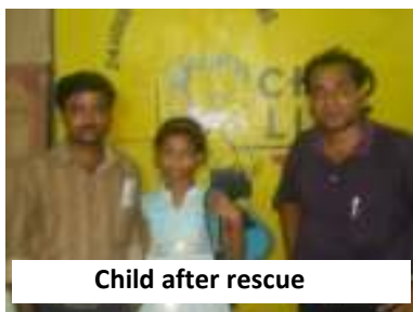
Child after rescue

Child Labour Rescue Operation : On 10 th July a 13 years old girl was identified and rescued from Salt Lake Sector – III, Sarbani Housing, with the help of The Bidhannagar P.S, Labour Department and KMWSC-CHILDLINE. The child was found working as a ‘live in’ domestic worker in a renowned medical officer’s house. With intervention it was clear that the employer tortured her physically and mentally. The child was even denied proper food and clothing.